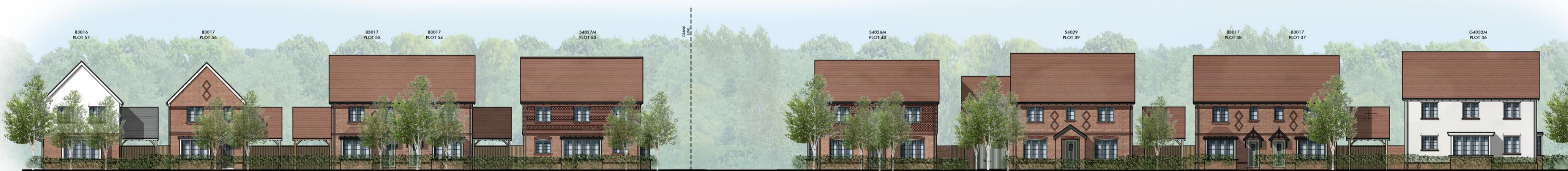
STREET SCENE F-F