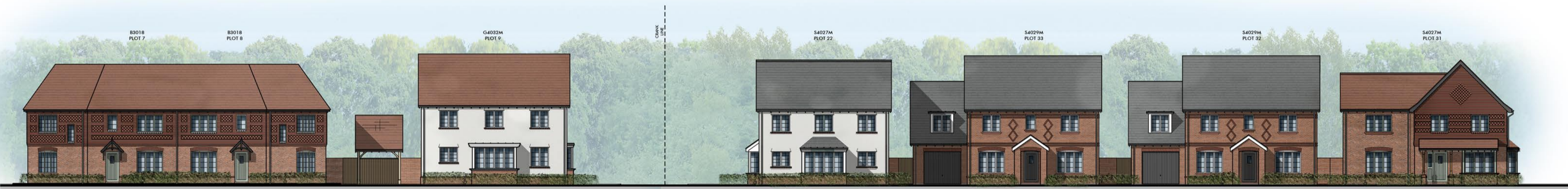
STREET SCENE D-D