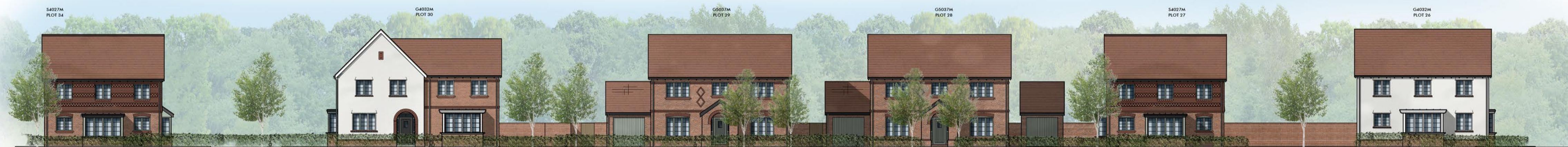
STREET SCENE E-E