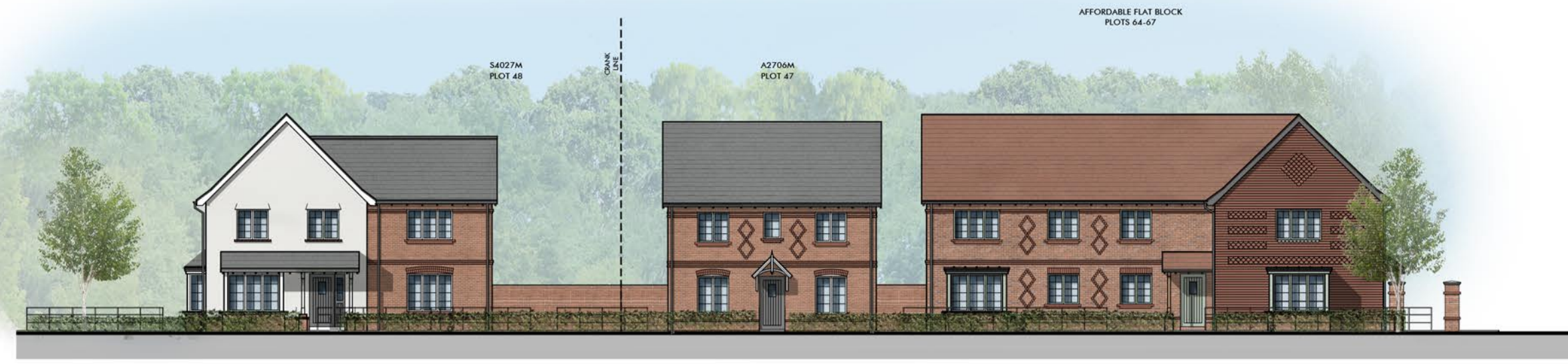
STREET SCENE C-C